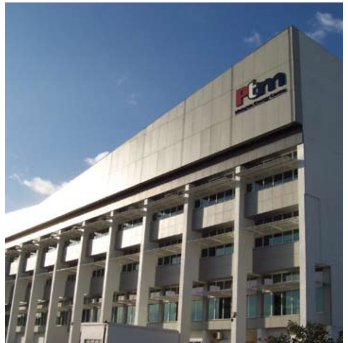
Malaysian Energy Centre Building, Bangi, Malaysia

of the fibres from the lungs. High-alumina, low-silica wool dissipates approximately 10 times faster from the lungs than traditional stone wool (Guldberg et al.; IARC Monograph).